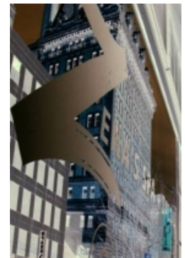
Zena Spa & Day Salon

DESCRIPTION: Operating in the Inner Harbor since the turn of the 19th century, this salon has perfected its craft. Keeping the people of Baltimore beautiful and healthy requires expertise in skin, hair, nails and body treatment methods. Monica's also offers massage and reflexology to pamper you in their relaxed and stylish location.