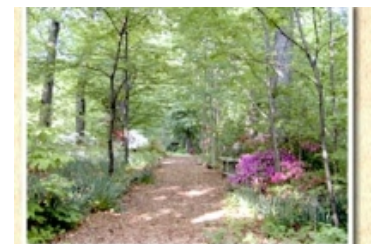
Cylburn Arboretum Association

DESCRIPTION: You'll have to look for this one, but when you find it -- just off Northern Parkway, a quick run up the Jones Falls Expressway -- you'll be thrilled by the fascinating