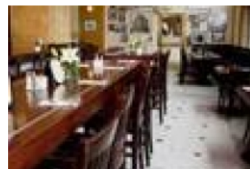
Pete's Cafe and Bar

DESCRIPTION: This cafe-cum-bar is located in the Old Bank District in downtown Los Angeles. Styled after the popular bistros in New York, it serves American cuisine in a relaxed setting. Worthy of mention are the beef carpaccio, spinach and sweet apple salad, flat iron steak with bleu cheese fries, and crispy shoestring fries. Have your meal either inside the main dining room, at the bar counter, or outdoors. Enjoy the live music and ask the waitstaff for recommendations from the wine list. There is ample parking nearby, so drive here for an enjoyable late night meal.