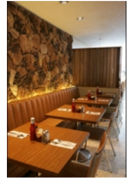
101 Coffee Shop

DESCRIPTION: A retro coffee shop right out of the early '60s with rock walls, funky colored tiles, comfy booths, and cool light fixtures, all pulled together nicely in a hip yet subdued fashion. Count on tasty grinds until 3am (try the breakfast burritos). © Frommer's