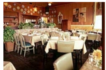
One of "America's Top Restaurants"

DESCRIPTION: Richard Benz, formerly of Gautreau's, has mastered the "new" New Orleans cuisine making this a dining hotspot. This casual spot with comfortable seating is a collaboration of home and contemporary styles. They complement each other nicely inside pumpkin colored walls adorned with hand-painted plates and vases of fresh flowers. The atmosphere is upscale casual. Start with the Pain Perdu or the fried oysters. For dinner opt for one of its many choices of Smoked Whole Fish, or go for the Pecan Crusted Gulf Fish. Decadent delights for the sweet tooth include Coconut Mango Creme Brulee, and the Tchoupitoulas Tcheesecake. A wine list of whites and reds are sold by the glass or by the bottle. © wcities.com