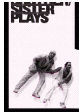
Public/Newman Theater (The)