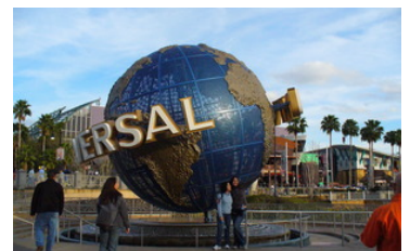
by Kristen Manieri

DESCRIPTION: The world's favorite films and film stars come to life here, and 40 amazing and amusing rides, shows and attractions await. A virtual interactive Terminator 2:3-D adventure has its own set of thrills, as does an encounter with Jaws, a trip Back to the Future, and a voyage beyond the stars in an E.T. Adventure. Special VIP tours are available by pre-arrangement. © wcities.com