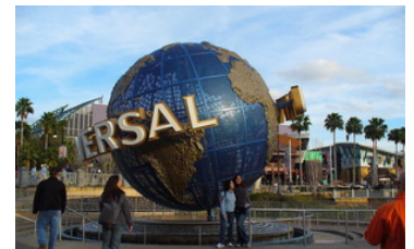
by Kristen Manieri

DESCRIPTION: The world's favorite films and film stars come to life here, and 40 amazing and amusing rides, shows and attractions await. A virtual interactive Terminator 2:3-D adventure has its own set of thrills, as does an encounter with Jaws, a trip Back to the Future, and a voyage beyond the stars in an E.T. Adventure. Special VIP tours are available by pre-arrangement. © wcities.com