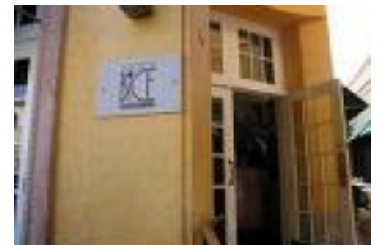
Bice - Palm Beach

DESCRIPTION: Bice's cuisine far surpasses that of Amici's, but as far as atmosphere, the air in here is a bit haughty, bordering on rude. Servers and diners alike have attitudes, but you'll forget all that with one bite of the juicy veal cutlet with tomato salad or the pasta e fagioli (pasta with beans). © Frommer's