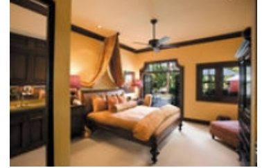
Cafe Boulud Palm Beach

DESCRIPTION: Snowbird socialites rejoiced over the opening of star chef Daniel Boulud's eponymous restaurant in the Brazilian Court hotel. Nonsocialites said, "Figures, another restaurant where we can't afford even a bread crumb." If you're out to splurge, Boulud is ideal, with an exquisite menu divided into four sections -- La Tradition (French and American classics), La Saison (seasonal dishes), Le Potager (dishes inspired by the vegetable market), and Le Voyage (world cuisine). The roasted barramundi with squash, pomegranate, and brown butter is superb. There's also a light menu offering salads, sandwiches, and even a cheeseburger if you prefer -- try the chick pea fries with piquillo pepper ketchup. If star chefs, stuffy socialites, and froufrou cuisine aren't your thing, don't even bother. © Frommer's