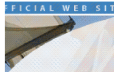
Arizona Museum for Youth

DESCRIPTION: Interactive activities have been the hallmark of this unique museum dedicated to kids. Experiencing different media through experimentation has been the fun way kids have been learning at this creative outlet. Experience interactive displays for kids in the What on Earth? exhibit. Please call for current exhibit information. Minimal admission for ages 2 and up. © wcities.com