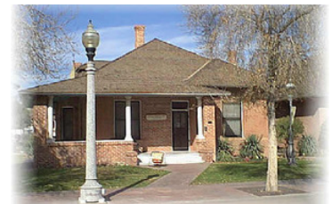
Arizona Doll and Toy Museum

DESCRIPTION: This fully restored 1900s home, known as the Steven's Bungalow, now provides a glimpse into the toys of the past. On display in the Historic Heritage Square, this red brick structure is located at the northwest corner of Washington and Seventh Streets. Dolls are exhibited in a recreated one-room schoolhouse. Other items include antique dollhouses and toys. Admission fee. Credit cards not accepted. Nearby, you will find other historic homes including the Rosson House and the Silva House.