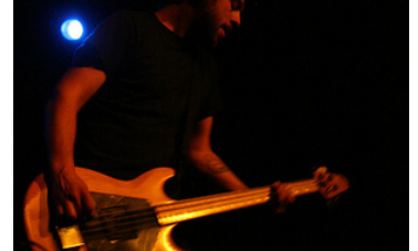
team obama 08

DESCRIPTION: This venue is a great place to catch a live musical concert in the whole of Tempe. Various bands - local and international, are known to perform here. So if you're a true music lover, then attending a concert at Marquee would make for a great experience, what with all the swaying crowds, old and new crooners, beer and plenty of parking space. Tickets can be booked at the box office or through phone orders. © wcities.com