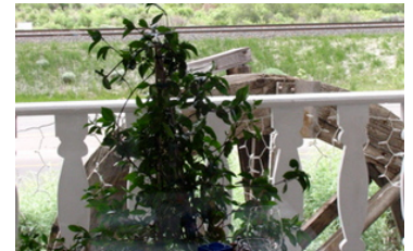
4th Street Bistro