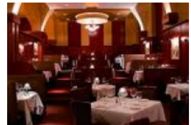
Donovan's - Salt Lake City

DESCRIPTION: Celebrate Restaurant Week all year long! Enjoy a Chop House Salad, one of three special entrees, and your choice of desserts for only $40! Donovan's is proud to be the only steakhouse in Utah that guarantees USDA rated prime beef each time you visit. With the most succulent ribeyes, tender filets and delicious seafood options in town, Donovan's cannot be beat. Donovan's sets the standard of steakhouse excellence. An appealing atmosphere of rich mahogany, eye-catching paintings and bronze sculptures artfully bathed in soft flattering light. Upscale and worldclass yet cordially friendly with attentive, unobtrusive service that accentuates every detail. This is truly the place to be to relax and enjoy dining perfection.