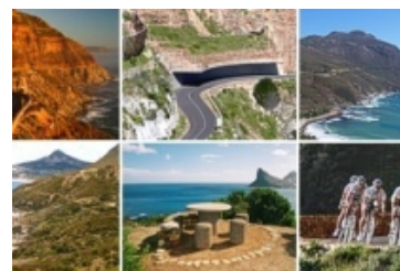
Chapmans Peak Drive

DESCRIPTION: One of the most beautiful drives in the world, Cape Town's Chapmans Peak Drive is a spectacular 10 km coastal drive linking Noordhoek to Hout Bay. In spring (Sept-November) Southern Right Whales can be spotted in Hout Bay. Year round there are stunning views from numerous viewpoints and picnic spots. A trail to Chapman's Peak itself starts just before the highest viewpoint on Chapman's Peak Drive. If the road is closed or if one only wants to access the portion of the road closer to Hout Bay, a complimentary day pass can be acquired from the toll booth.