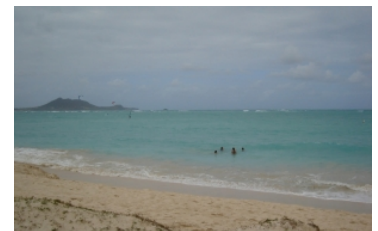
Steve and Sara

DESCRIPTION: This beach lies on Oahu's east shore in Kailua Bay. It is a world-class windsurfing destination and an all around good spot for water sports. The beach itself has fine sand, is wide and winds a few miles around the bay. It gently slopes into the ocean providing a sheltered place for swimming. This site provides good conditions for body surfing, board surfing, kayaking and beach combing. The biggest attraction to Kailua Bay is windsurfing. Several shops in Kailua provide windsurfing lessons and equipment rental. Facilities at Kailua Beach include: showers, telephones, picnic tables and restrooms. Lifeguards are normally on duty. © wcities.com