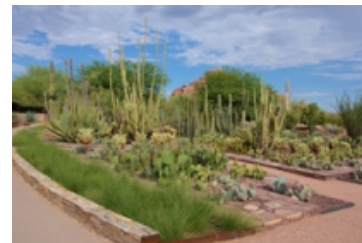
Desert Botanical Garden

DESCRIPTION: The Desert Botanical Garden in Phoenix is handily one of the city's best attractions. The Sonoran Desert comes to life in the miles of paved&nbsp; garden paths, dusty nature trails, and interpretive displays. In recent years, the Garden has become a nexus of cultural activity, hosting wine tastings, seasonal fairs, music in the garden series, and outdoor art exhibits from world-renown artist. Truly one of the most beautiful places to visit in the Valley of the Sun.